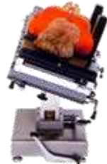
Lateral Tilt (not available XRT 2000)