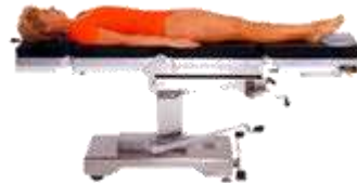
Head and Leg sections reversed (not available XRT 2000)