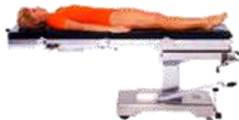
Head section into Leg section (not available XRT 2000)